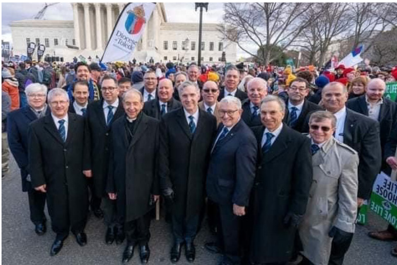
Supreme Board members at the Walk for Life in Washington DC

Do you pay much attention to what you say and how you say it? Do you notice what you hear around you, whether from the people in your life or from media you consume? What are some specific ways you can try to avoid speech that fails to show respect for God?